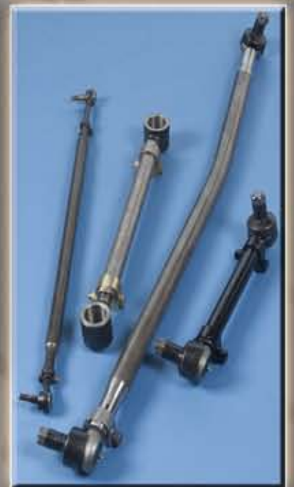
Drag & Stabilizer Links