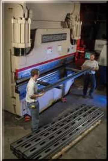
350 Ton CNC Forming