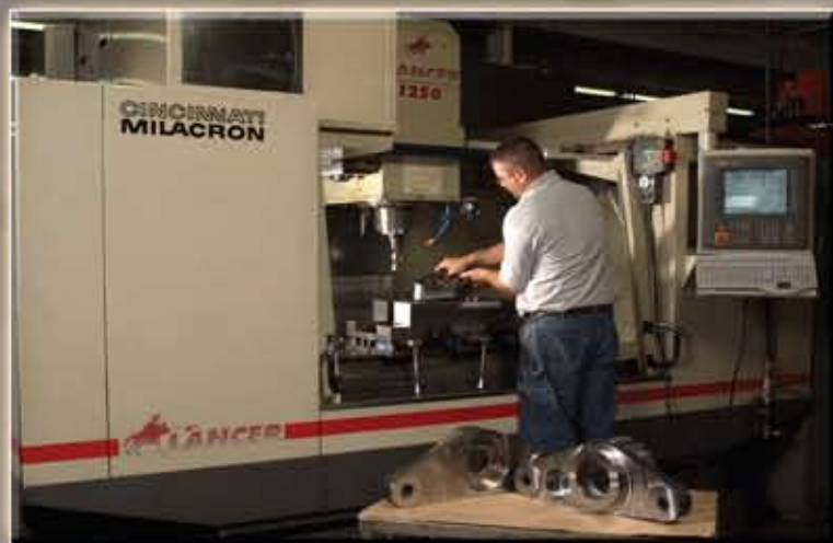
CNC Machining Center