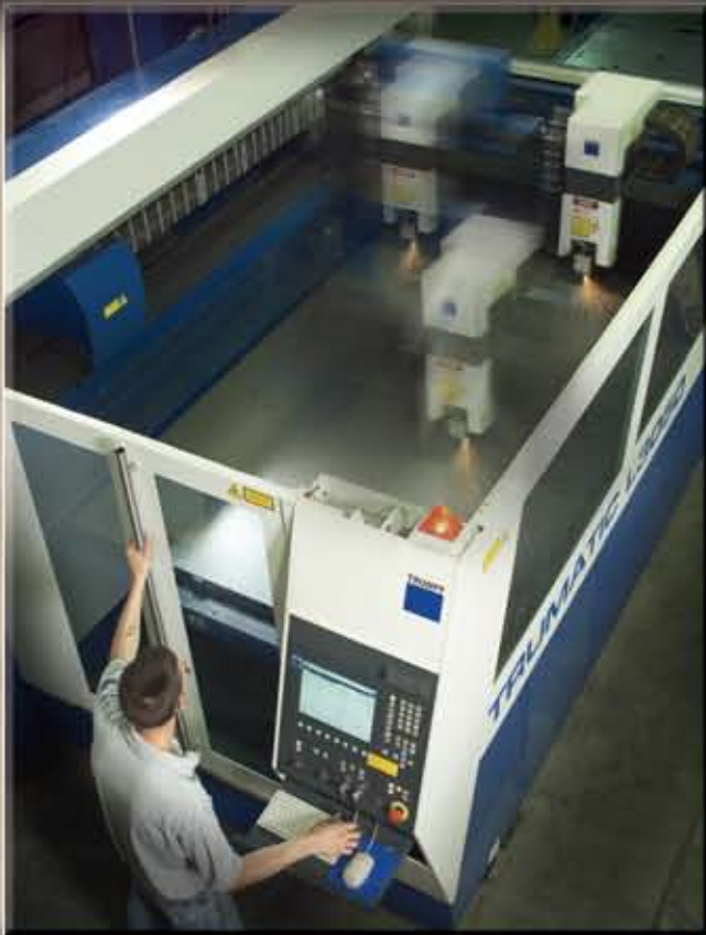
CNC Trumpf Sheet Laser