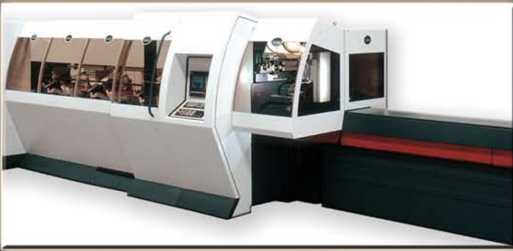
CNC BLM Tube Laser