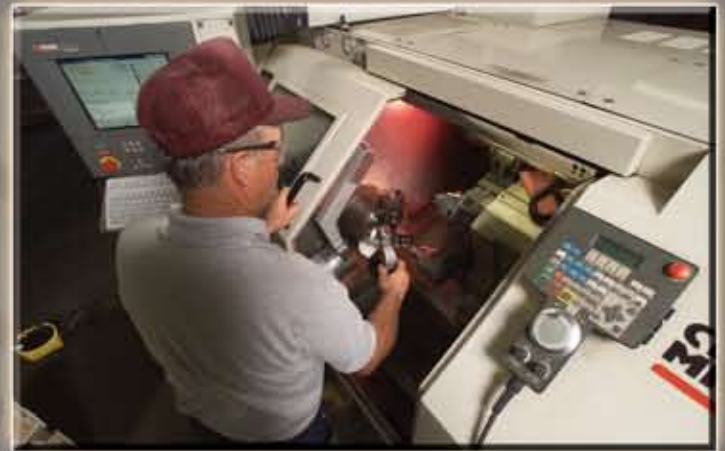
CNC Turning Center