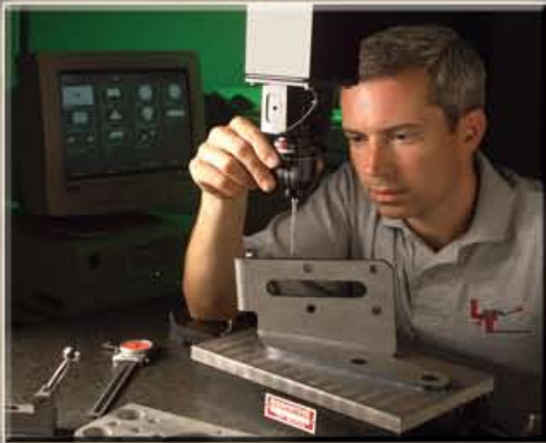
CMM Quality Control